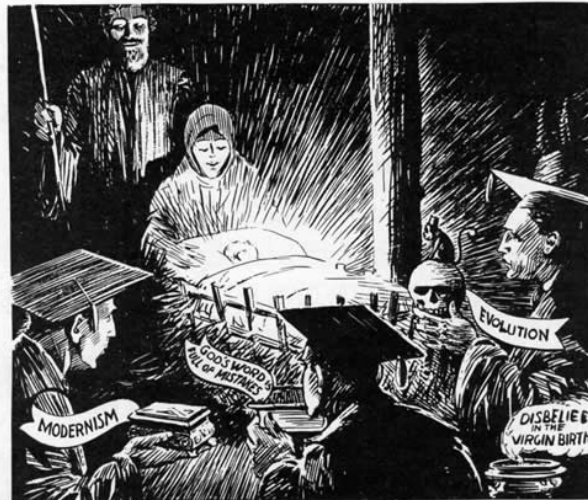
Professing themselves to be wise, they became fools.—Romans 1:22