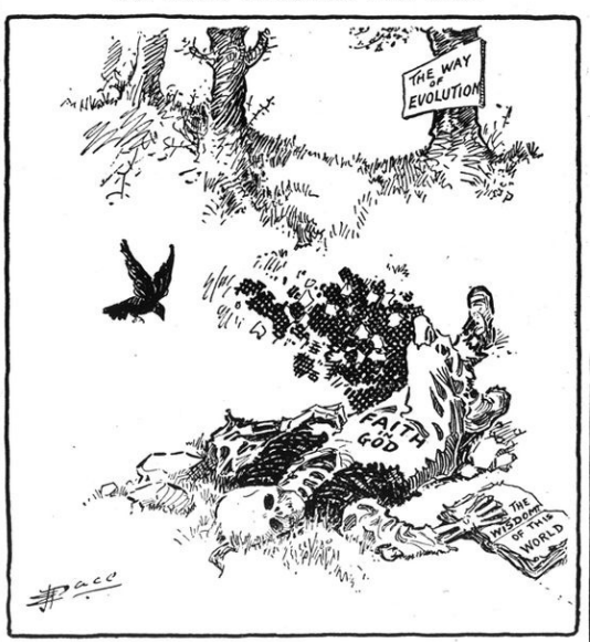
THE END OF THE ROAD!