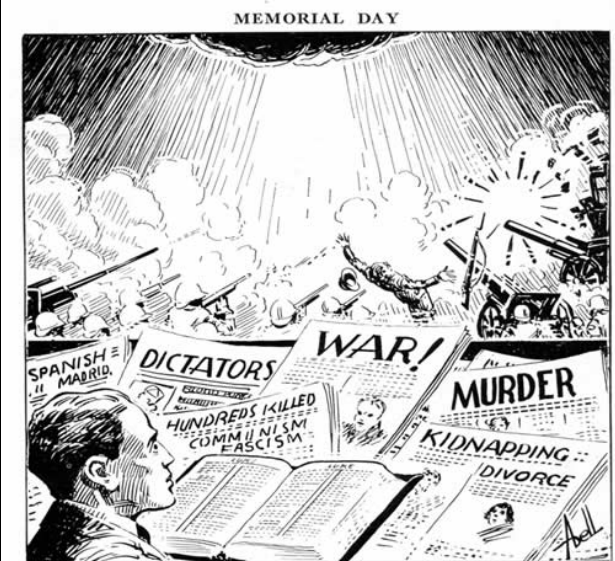
The outlook and the uplook (Luke 21:28)

Many are now simply descending into despair because they have not been told that a loving Creator waits for their commitment to Him. At that point Satan wins because his suggestion of suicide seems to be the best way out of the misery, which is overwhelming for some.