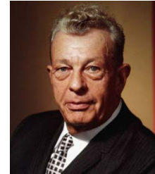
Everett M. Dirksen 1896 - 1969